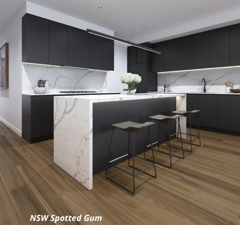
NSW Spotted Gum