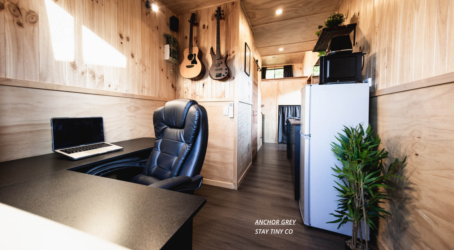
ANCHOR GREY STAY TINY CO