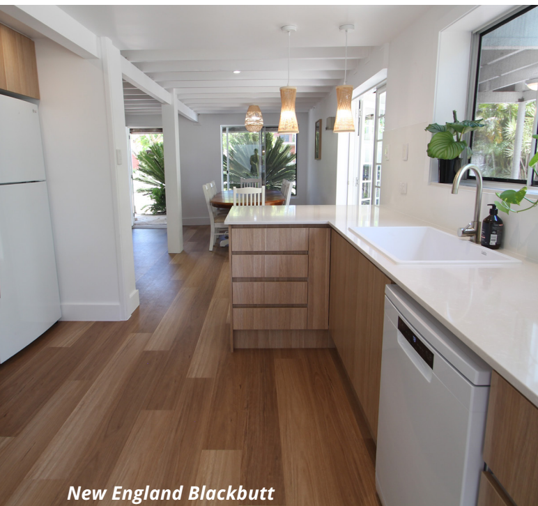
New England Blackbutt